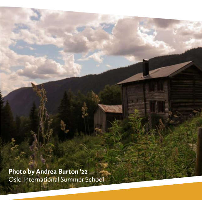
Oslo International Summer School