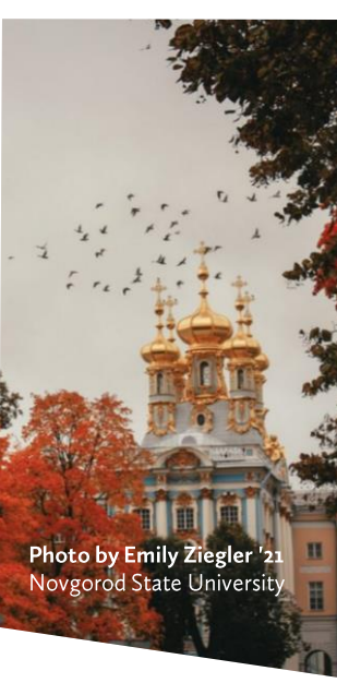
Novgorod State University