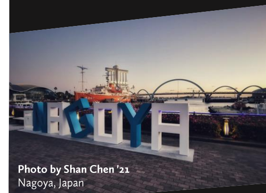
Nagoya, Japan

Tomson Hall 380 +1 507 786 3069 ios@stolaf.edu