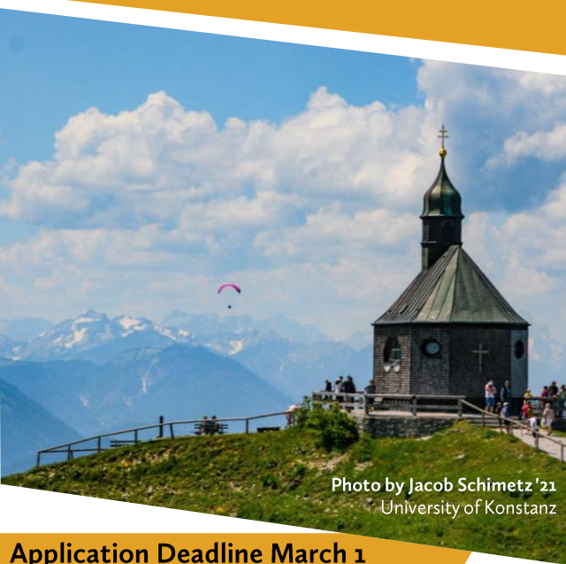
University of Konstanz